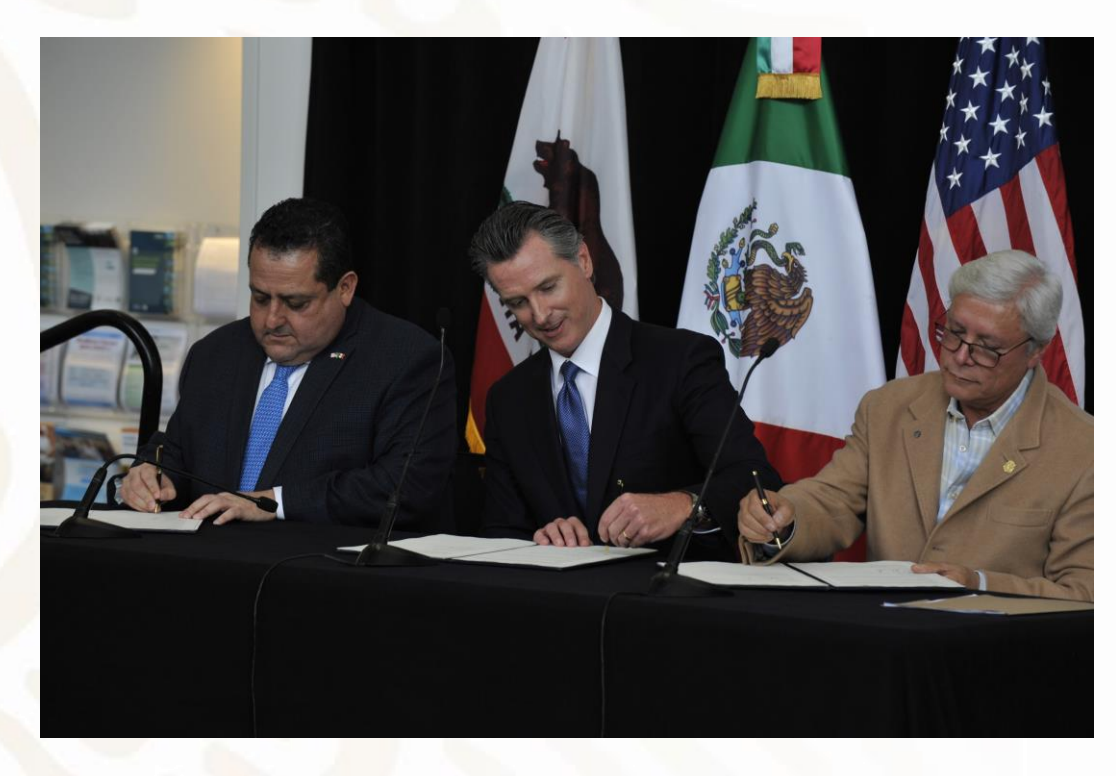
COMCAL Singing Ceremony December 4<sup>th</sup>, 2019 San Diego, CA